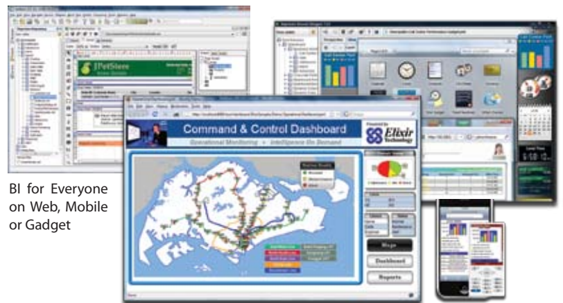
BI for Everyone on Web, Mobile or Gadget