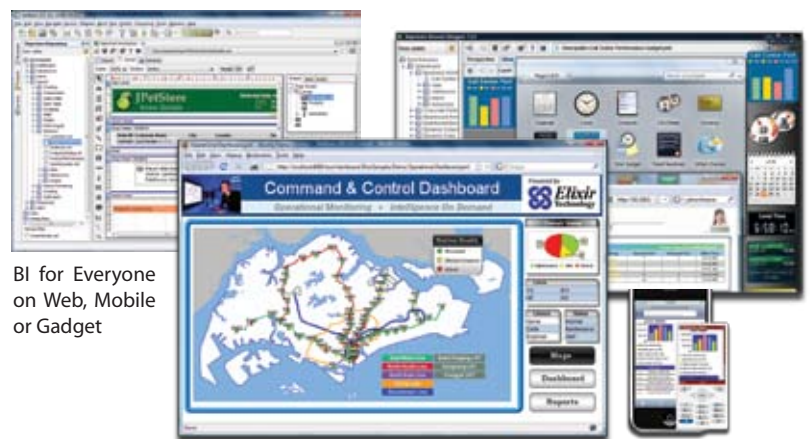
BI for Everyone on Web, Mobile or Gadget